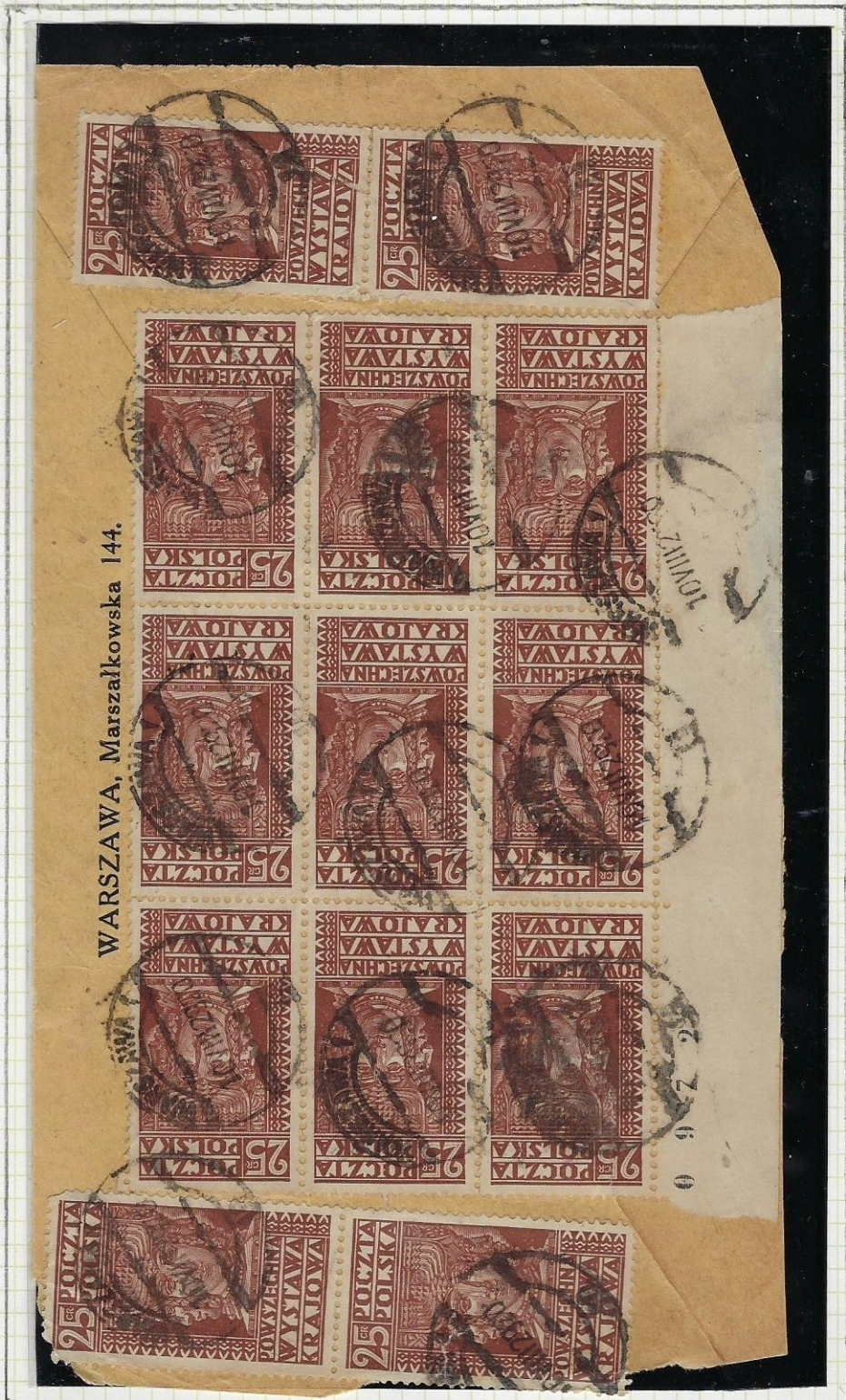
Piece franked 3zł in total (in those days enough for a large parcel).