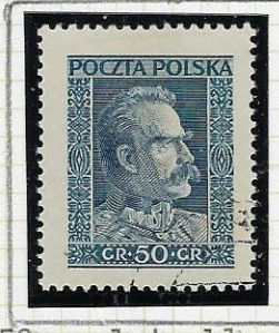
50gr slate-blue: Marshal Piłsudski, ex M/S. (used)