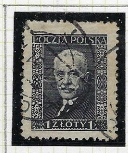
1zł slate-black/cream President Mościcki (iss. 1930) horiz. laid paper Perf. 11\frac{1}{2} .