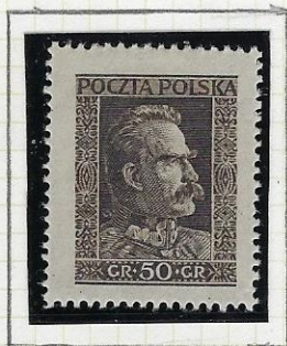
50gr deep sepia: Marsh. Piłsudski. (1867 - 1935)