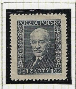
1zł slate-black/cream President Mościcki (iss. -/5/28) vert. laid paper Perf. 11\frac{1}{2} \times 13