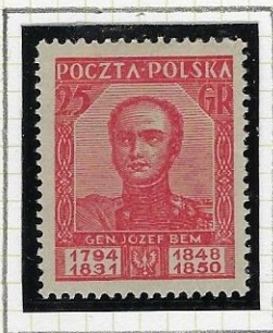
25gr bright rose: Gen. Józef Bem

and in the defense of Gdańsk (1813). He returned to Polish service in 1815 and fought with distinction against Russia (1830-31). In 1848 he defended Transylvania for the Hungarian leader Lajos Kossuth and in 1849 he performed prodigiously with a small force against a large Austrian force. After the collapse of the Hungarian rebellion he became governor of Aleppo for the Turks.