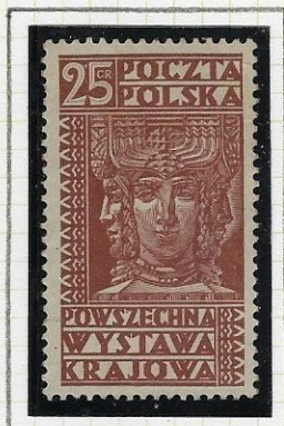
25gr red-brown: The ancient Slav God, Światowid.

15 Dec. 1928: General National Exhibition in Poznań . One stamp, designed by Z.Kamiński and printed typo by PZG, Warsaw, on medium, smooth white paper. Clear or yellowish gum. No watermark. Perf. 12 x 12½. Issued in single-pane sheets of 15 x 10 stamps. Two colour shades.