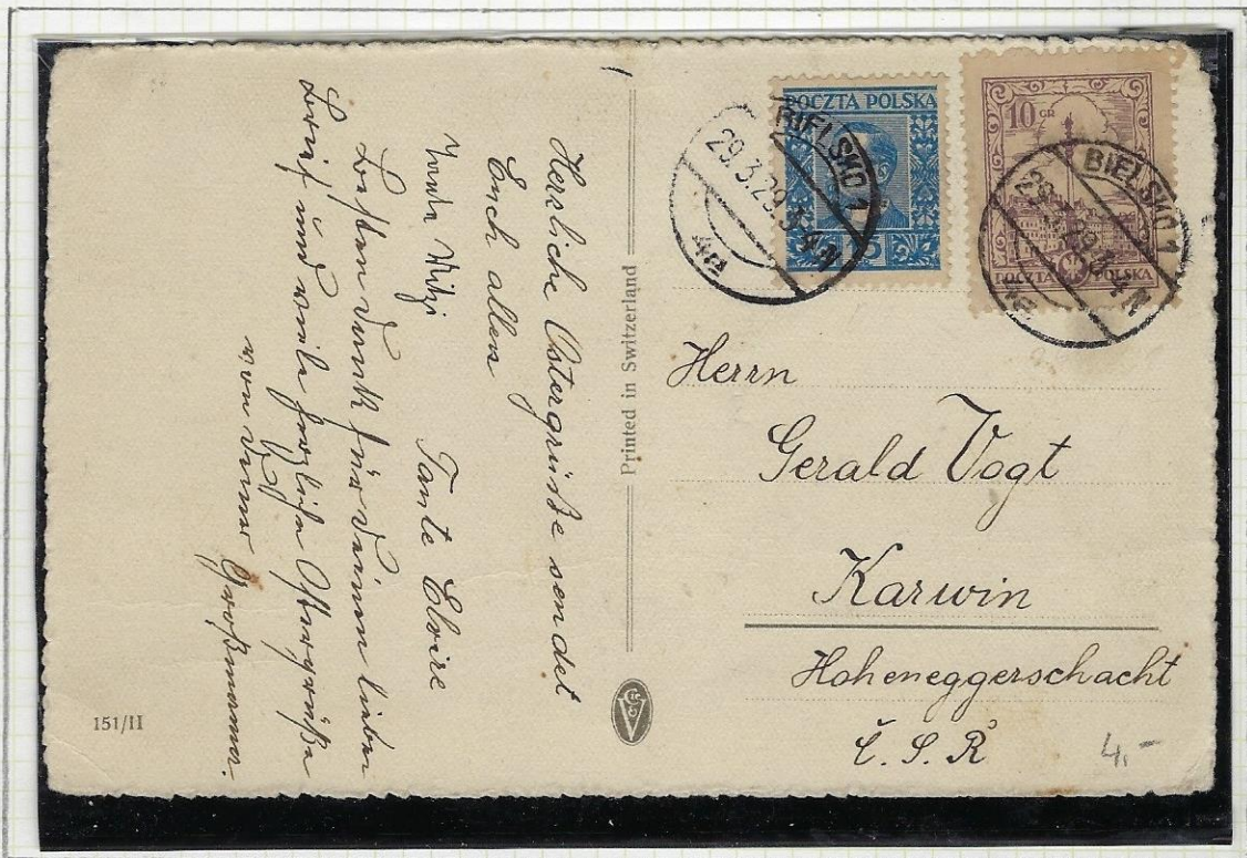
15gr Sienkiewicz stamp, plus 10gr stamp of the 1925-27 Various Views issue, on a Printed in Switzerland showing Easter Bunny, Easter Eggs, and Spring Flowers with a legend (in German) "Happy Easter Greetings". Card sent from Bielsko (in S.W. Poland) on 29.3.29 to Karwina (in the nearby ethnically Polish part of Czechoslovakia, i.e. a foreign, but European, country. Postage 25gr.