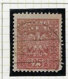
25gr red-brown: grey red-brown: yellow-brown: Polish White Eagle.

Quantities: 5gr 319,723,850; 10gr 162,254,700; 25gr 306,679,300. Validities: 5gr and 10gr: until 31 May 1936; 25gr: until 3 Dec. 1931.