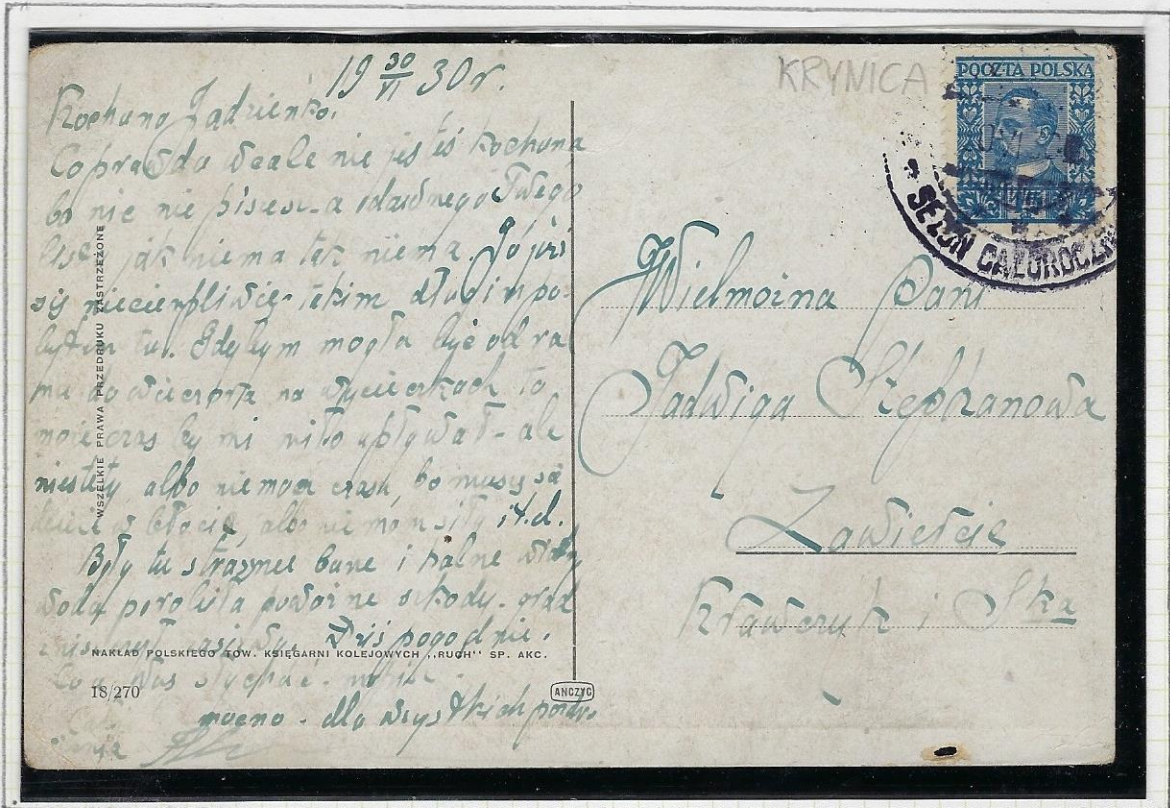
Sienkiewicz stamp, internally used on a picture postcard sold in "Ruch" kiosks on railway stations, etc. This card shows a view of the mountains of the Tatra National Park as seen from Krynica, further east. Sent probably from Krynica June 19th, 1930, to Zawiercie; special postmark mentioning "SEZON CALOROCZNY" (= "Whole Year's Season"). Postage (internal usage) 15 gr.