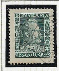
50gr blue-green: Marshal Piłsudski (iss. -/5/31) Perf. 10\frac{1}{2} \times 11\frac{1}{2}