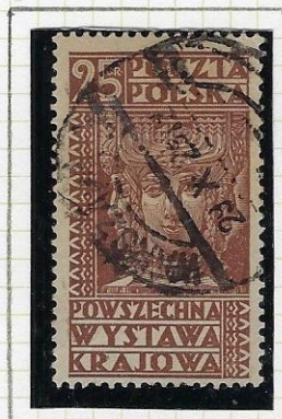
25gr slightly darker and greyer red-brown: The Four-faced Slav God Światowid.