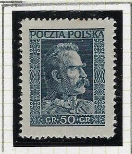
50gr bluish slate: Marshal Piłsudski (iss. -/5/28) Perf. 13 \times 12\frac{3}{4}

May, 1928 - 1930 - 30 Aug. 1937: Marshal Józef Piłsudski and President Ignacy Mościcki . Stamps of the 1928 Warsaw Philatelic Exhibition in different colours.