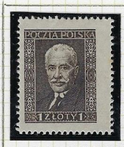
1zł black: President Mościcki (iss. 1/9/37) smooth paper, ex M/S Perf. 12\frac{1}{2} \times 12\frac{3}{4}

Quantities: 50gr (sheet) 105,000,000; 1zł (sheet) 20,200,000; 50gr & 1zł (M/S) 105,500 each.