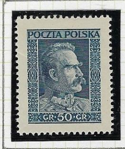
50gr slate-blue: Marshal Piłsudski (iss. 30/8/37) Perf. 12\frac{1}{2} \times 12\frac{3}{4} (ex M/S).