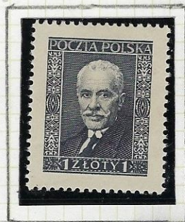
1zł deep sepia: Pres. Mościcki. (1867 - 1946)

These two stamps were printed in Mini-sheet format only (see next page).